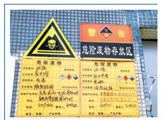
Storage area of hazardous wastes in production workshops