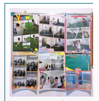
Sport and leisure facilities in factory area

In addition, it is the policy of the Group to maintain a healthy workforce, promote healthy working conditions and enable employees to maintain a healthy lifestyle. The Group provides different sport facilities in factory area and continuously organises bi-annual sports gala. The Group has arranged doctors to conduct annual checkup for workers at its manufacturing site. Furthermore, the Group has participated in different types of sporting events and leisure activities organised by nearby community centers and government associations.