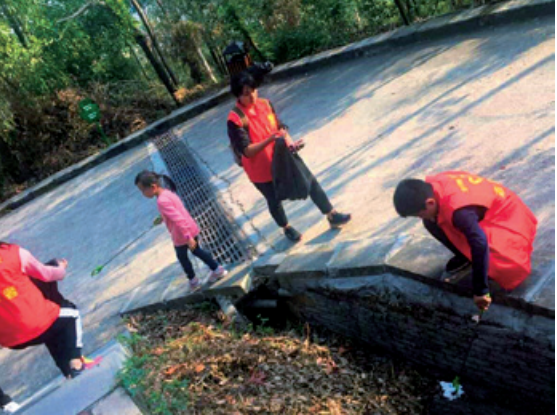
Factory volunteers and their families participated in a fun day event at outdoor

The Group believes that such activities are not only beneficial to the health of staff, but are also conducive to bond building outside of the workplace, improving cross-departmental communications, and promoting camaraderie, leading ultimately to a more harmonious and productive working environment.