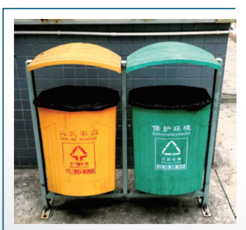
Waste separation facilities separating recyclable and non-recyclable wastage materials in factory area

The Group strives to discover means to achieve waste recycling, in order to promote green living habits, the manufacturing subsidiaries of the Group located in the PRC has provided waste separation facilities with "Recyclable", "Non-recyclable" and "Hazardous" labels for classification of different types of solid wastes. Hazardous wastes are collected and treated by qualified companies engaged by the Group.